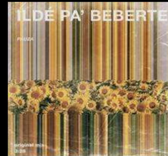
Idé Pa' Beberte (+310k)