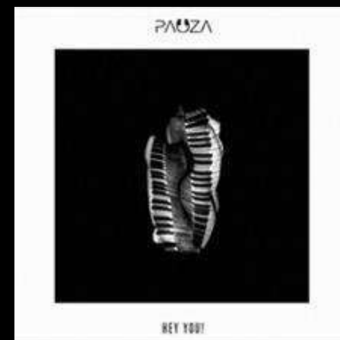
Cuban Groove (+31k)