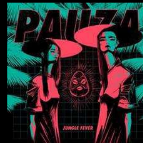
Jungle Fever (+618k)