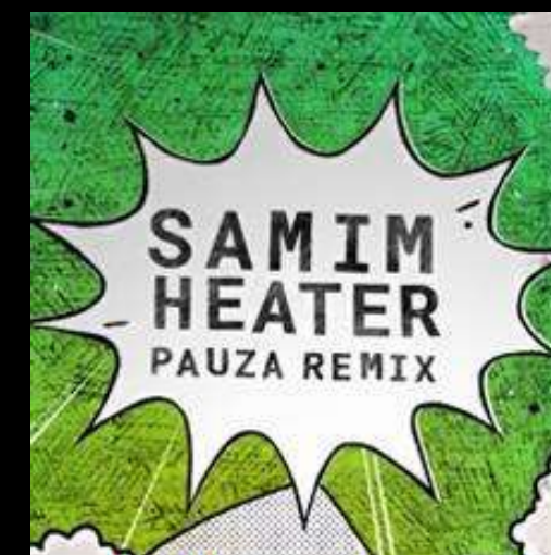
Heater Remix (+83k)