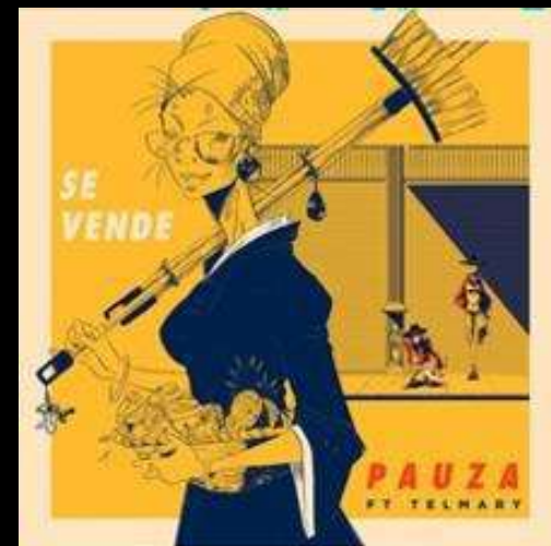
Se vende (+10k)