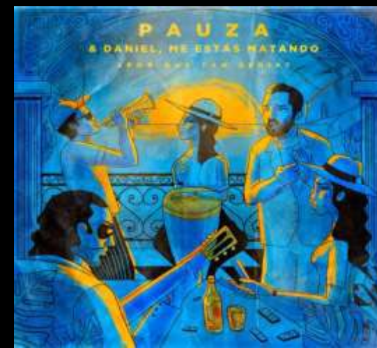
¿Por Qué Tan Seria? (+239k)