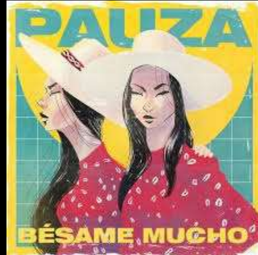
Bésame Mucho EP OUT NOW